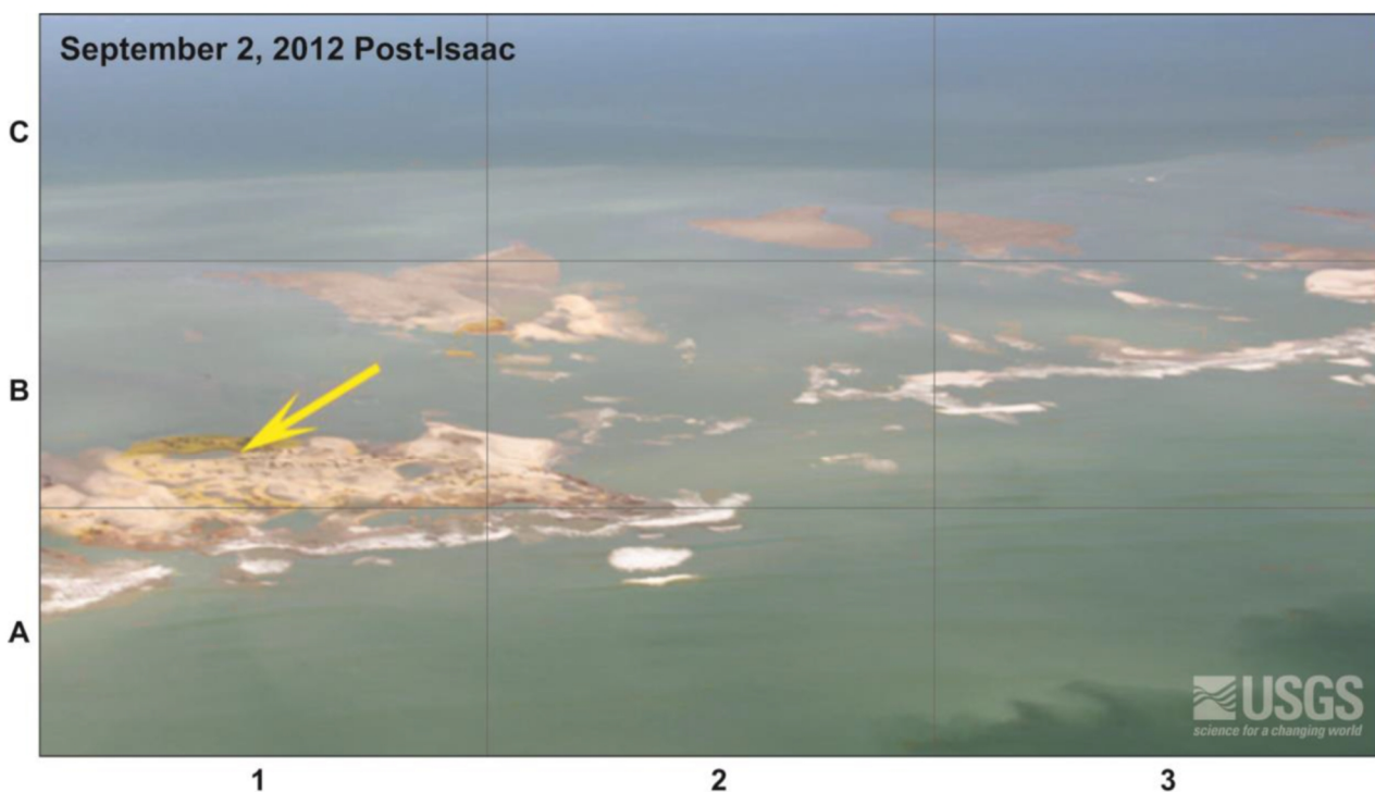
Chandeleur Islands, Louisiana, before and after the passage of Hurricane Isaac (an extreme weather event)